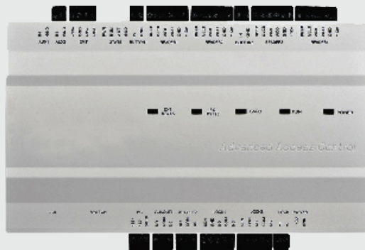
Smart MDC 222 Pro 2