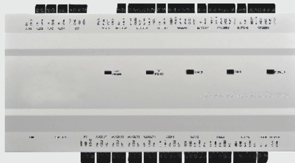
Smart MDC 222 Pro 4